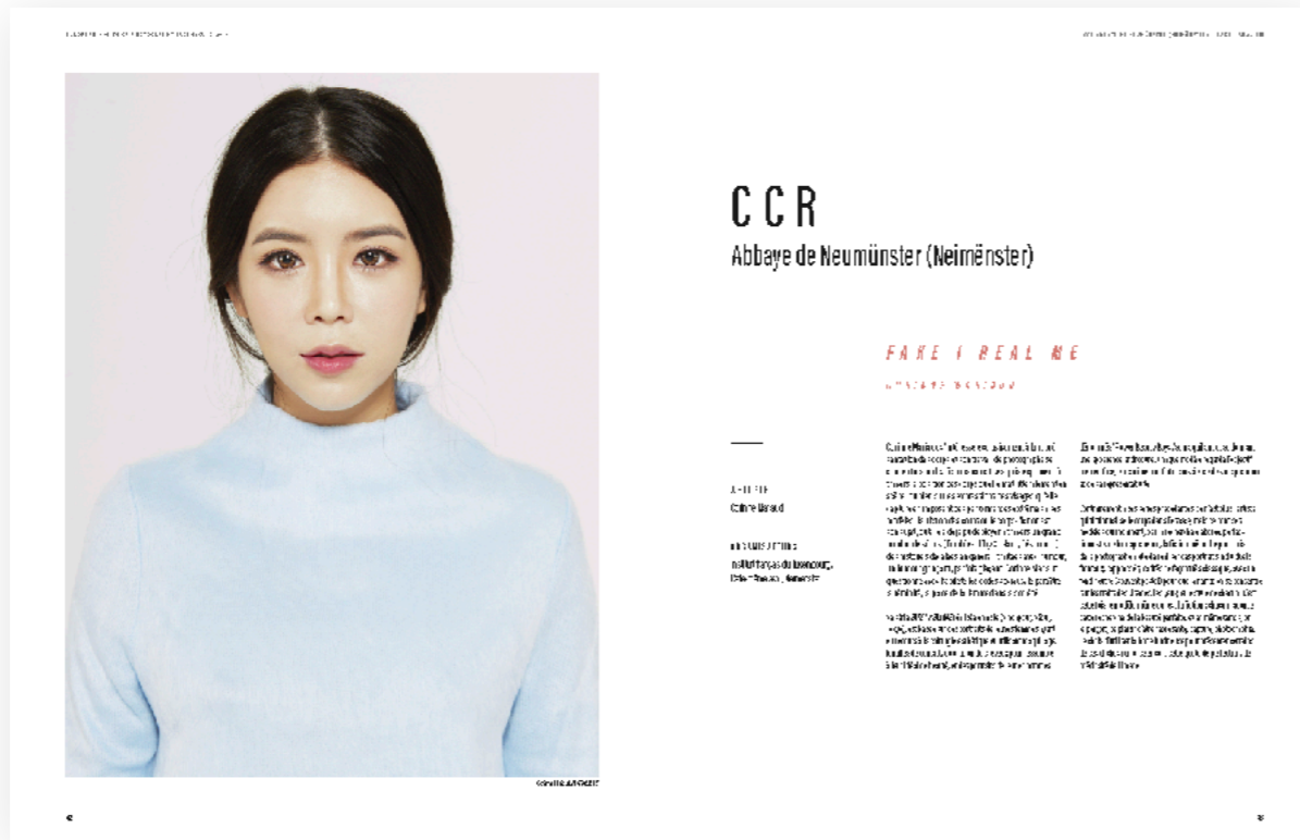
Catalog European Month for Photography Luxembourg 2019