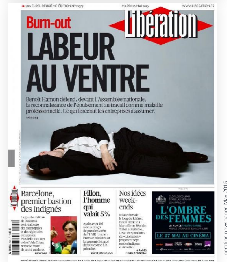
Liberation newspaper, May 2015