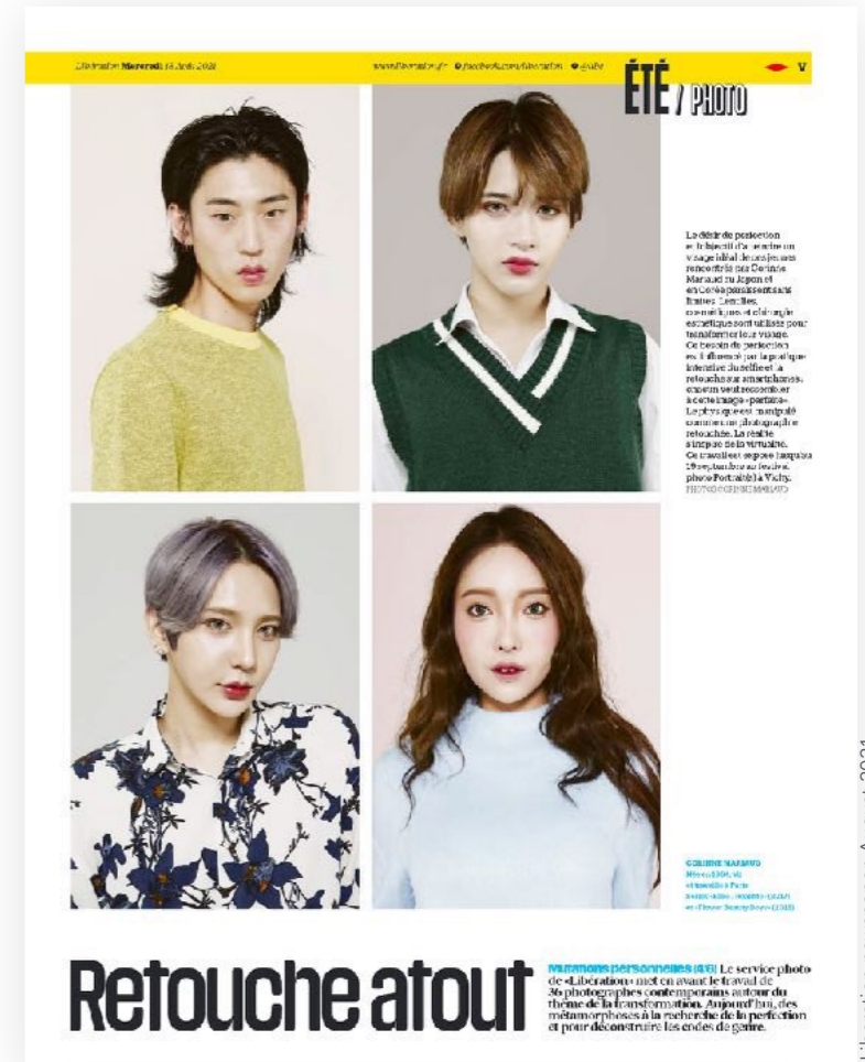
Liberation newspaper, August 2021